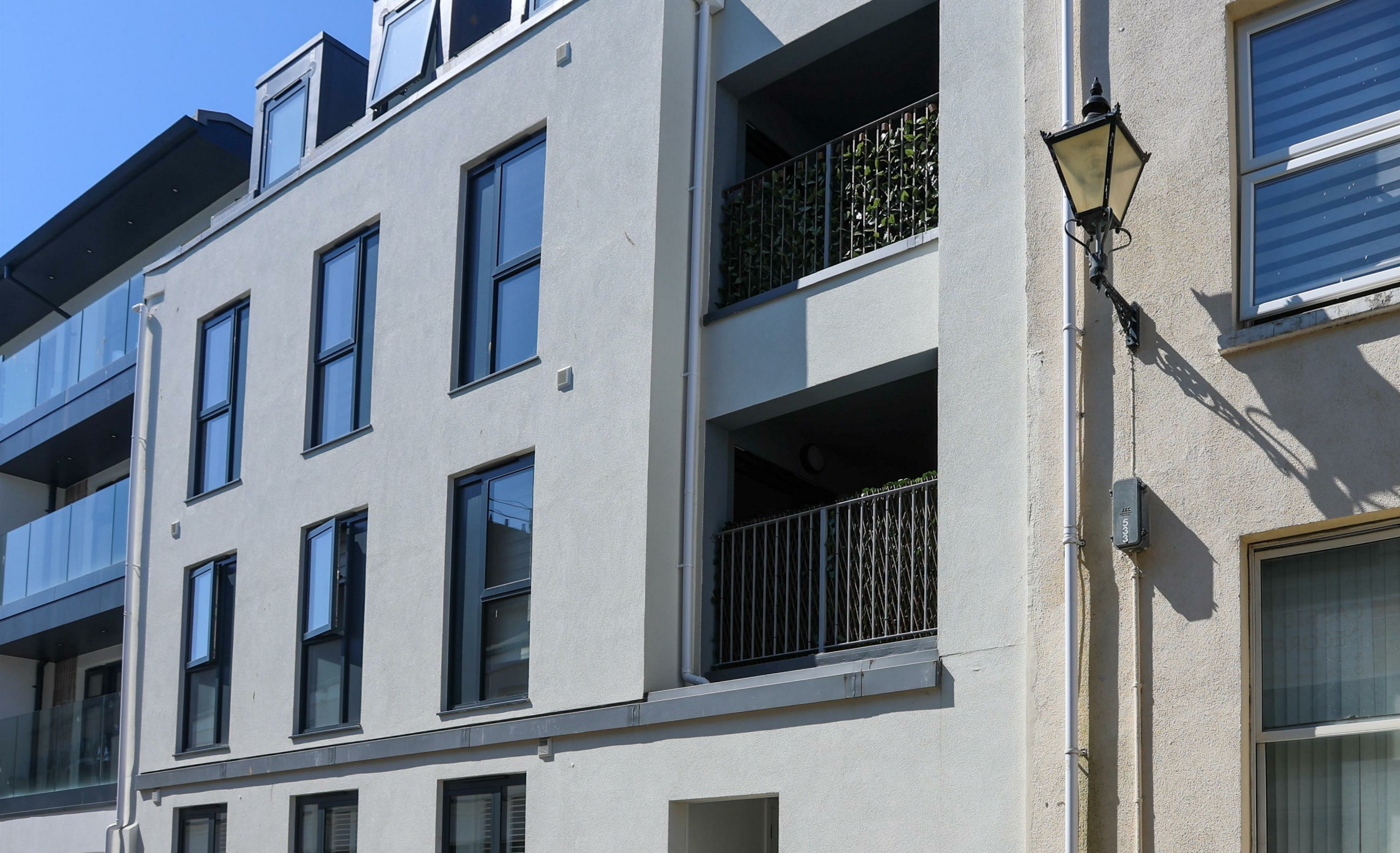
Flat 3 7 Duhamel Place, St. Helier, Jersey, JE2 4TP £315,000